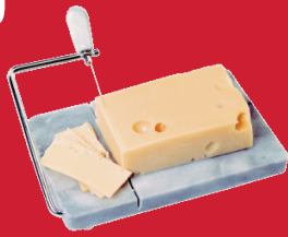
Solid Marble Cheese Slicer & Server (791582)