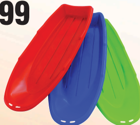
Glad-A-Boggan Sled (6139752)