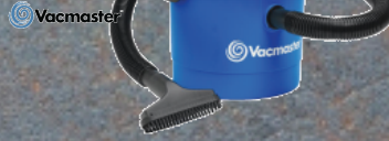
Portable Corded Canister Vacuum Cleaner (248918)