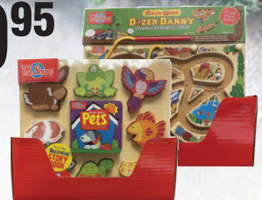
Limited to Stock on Hand Assorted Chunky Wood Puzzles (124707 Series)