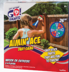
Aimin Ace Dart Game Indoor or outdoor for 2 to 4 players. (123003)