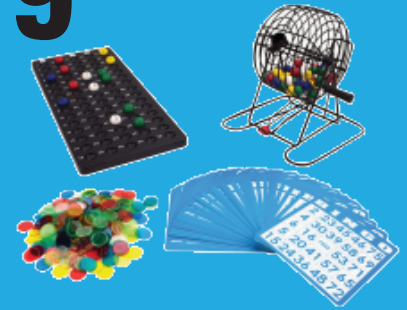
Deluxe Cage Bingo Set (107826)