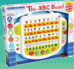
The ABC Board (121926)