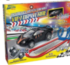
Victory Lane Toy Race Car Set (116430)