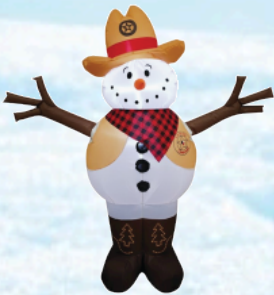
4-Ft. Inflatable Snowman Cowboy (123581)