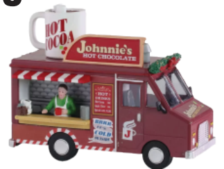
Johnnie's Hot Chocolate Christmas Village Figurine (4908083)