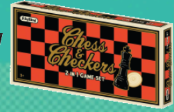
Chess & Checkers Set 2-In-1 Game (124718)