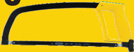
12" Hacksaw (0556712)