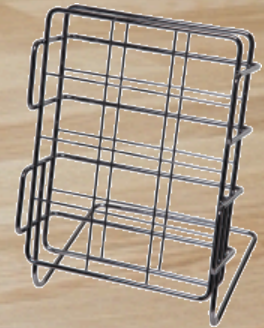
Countertop Spice Rack (0590125)