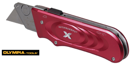
Turboknife X Red (3574928)