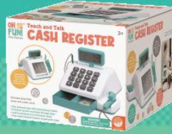
Teach and Talk Cash Register (125968)