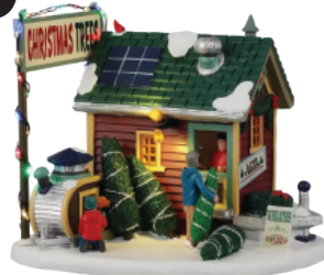
Tiny House Tree Lot Part of the Vail Village collection. (5037031)