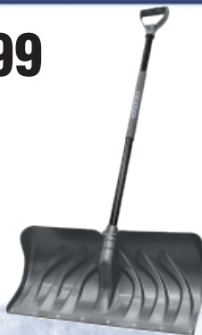
Steel Handle Snow Shovel (8924003)