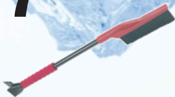
32-In. Snowbrush With Ice Chisel Scraper (9390493)