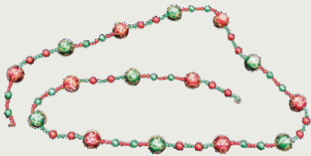
8-Ft. Red Bead Garland (238828)