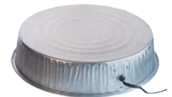
Heated Base for Poultry Waterer Designed for use with double wall metal fountains. For outdoor use in a dry, covered area. (6358949)