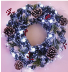
20-In. Fiber-Optic Wreath (123580)