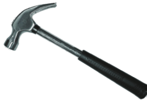
16 Oz Claw Hammer (9833831)