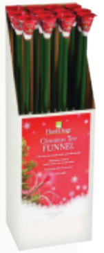
Tree Funnel Makes watering your Christmas tree a snap. (9036708)