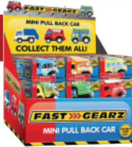
Mini Pull Back Car Assortment (114821)