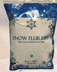
Snow Flurries Great for decorating your home. (4186888)