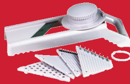
Mandoline Slicer (107672)