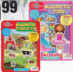
Magnetic Tin Play Set Assorted. (124699, 124700, 124703)