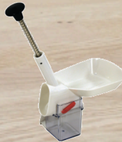
Cherry Stoner (130698)