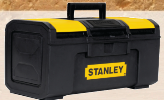
16-In. Auto Latch Tool Box One-hand operation latch. Extra-wide soft grip handle. Removable tray. Organizers on top lid. (0556746)