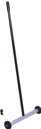
Mini Sweep Magnet 14-1/2-in. sweep width. (7897440)

MASTER MAGNETICS, INC. THE MAGNET SOURCE