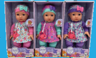
12-In. Baby Doll With Pacifier Ages 2+. (121788)