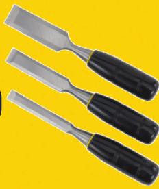
3 Pc. Thrifty™ Wood Chisel Set (5990734)