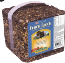
Purina Flock Block Whole grain enrichment supplement. (158203)