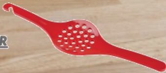
Boil Over Stopper (110886)