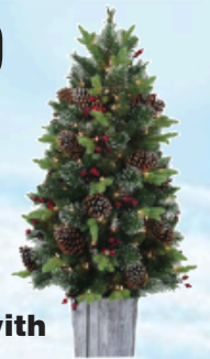
4-Ft. Prelit Tree with Barnwood Base Prelit with 100 clear lights. (2673671)