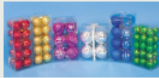
12-Pc. Shatter-Resistant Ornaments Assorted colors. Decorated finish. (9525304)