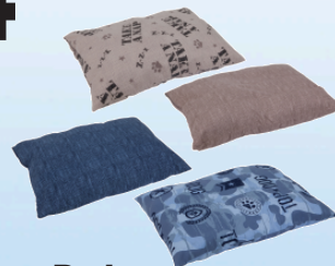
Cedar Dog Bed 36-In. x 27-In. (2214849)