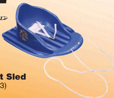
Infant Sled (863813)