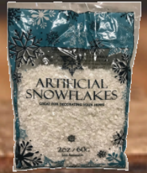
2-Oz. Glittered Snowflakes Great for your holiday decorating. (4215877)