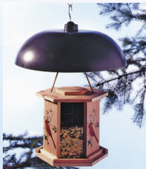
Two Way Squirrel Baffle Use hanging or with pole, fits 1/2-In. to 1-1/4-In. pole, covers bird feeder making it nearly impossible for squirrel to get seed. (396762)