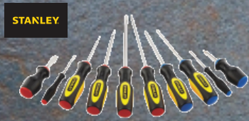
10-Pc. Screwdriver set (2272300)