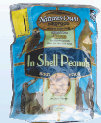
Natures Own Gold In-Shell Peanuts Bird Food Attracts wild animals and other ground feeding critters. (893164)