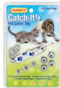
Laser Cat Toy Features 5 laser images for your pet to chase. (158260)